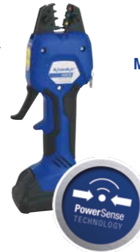
Micro | Electromechanical crimping tool 0.14 - 50 mm 2 – EK 50 ML