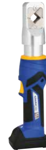
Battery powered hydraulic crimping tool for cable end sleeves 6 - 120 mm 2 – EK WF 120 ML