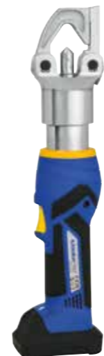
Battery powered hydraulic crimping tool 6 - 120 mm 2 – EK 30 ID ML